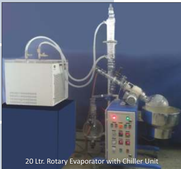
20 Ltr. Rotary Evaporator with Chiller Unit